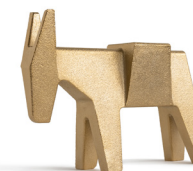
24K gold plated