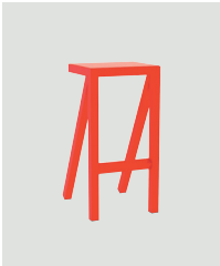
Fluorescent orange 5266