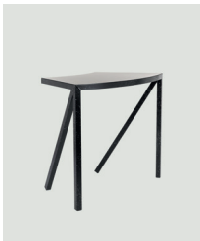
Black (splattered white)

We recommend using a soft rag, either dry or wet. When needed, use ph-balanced soap diluted in water. Do not use abrasive sponges as they may leave scratches. Avoid using acidic products, solvents and products containing ammonia. Periodic maintenance and cleaning allows the products to keep their original look and lengthens the duration of their performance.