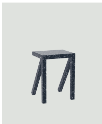
Black (splattered white)