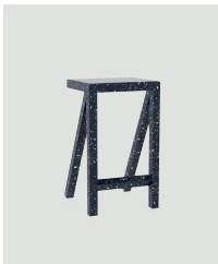
Black (splattered white)