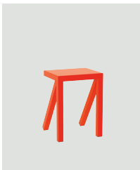
Fluorescent orange 5266