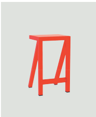
Fluorescent orange 5266