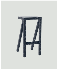
Black (splattered white)