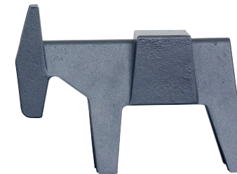
grey anthracite 5142