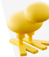
Yellow 1665 C Paws / yellow