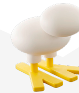
White 1735 C Paws / yellow