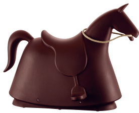
Matt colour Brown 1069 C