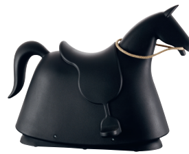
Matt colour Black 1768 C