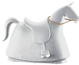
Matt colour White 1736 C