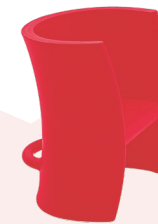
Red 1004 C