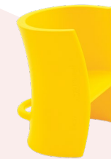
Yellow 1665 C