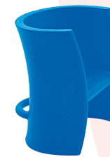
Blue 1252 C