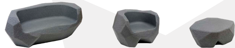
Grey anthracite 1407 C