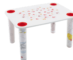
Salad Top / White 8500 Pen Holder + Feet / Orange 1001 C