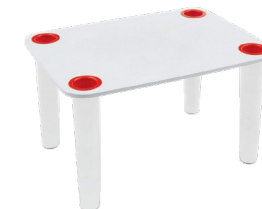
Top / White 8500 Pen Holder + Feet / Orange 1001 C