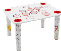
Circle Top / White 8500 Pen Holder + Feet / Orange 1001 C