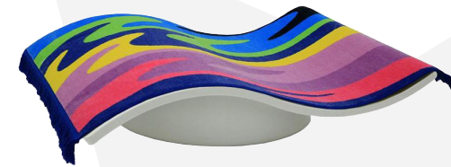
White 1735 C