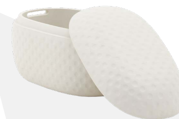
White 1735 C