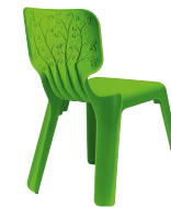
Matt colour Green 1342 C