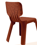
Matt colour Brown 1478 C