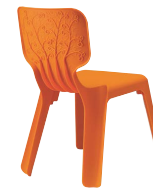
Matt colour Yellow 1037 C