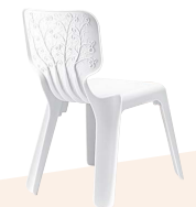
Matt colour White 1690 C