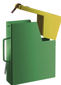
Matt colour Container: Green 1285 C Cover: Green 1355 C