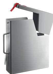
Matt colour Container: Grey 1395 C Cover: Grey 1395 C