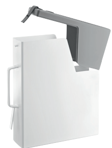
Matt colour Container: White 1735 C Cover: Grey 1395 C