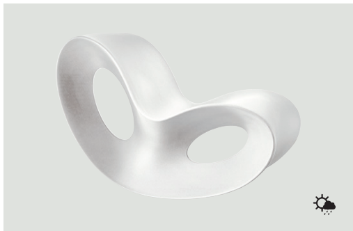
White 1735 C