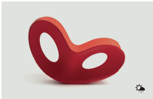
Red 1004 C