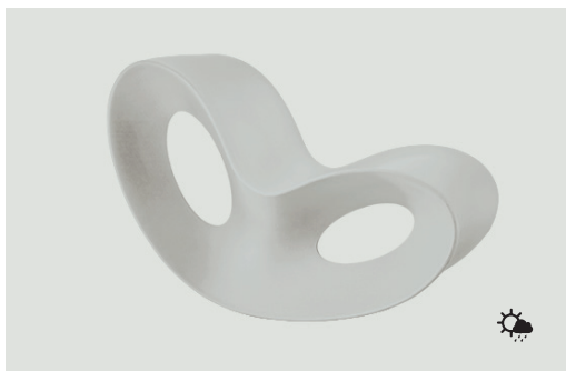
Light Grey 1395 C