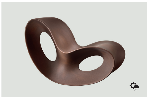
Rust Brown 1071 C