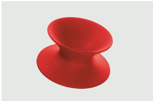
Red 1004 C