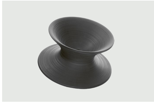
Grey Anthracite 1428 C