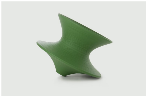
Green 1812 C