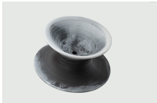
Bicolour - Grey Anthracite / Light grey