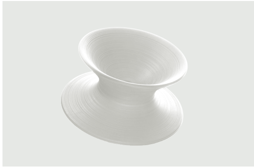
White 1735 C