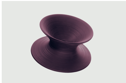
Dark Purple 1133 C