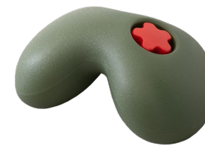
Green 1550 C