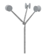
Frame / Galvanized 5250 Hooks / Grey 1771 C