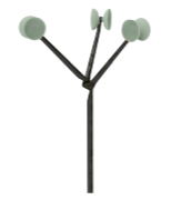
Frame / Grey anthracite 5142 Hooks / Green 1772 C