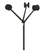
Frame / Grey anthracite 5142 Hooks / Black 1770 C