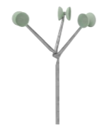
Frame / Galvanized 5250 Hooks / Green 1772 C