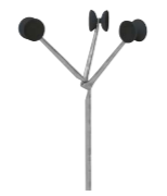
Frame / Galvanized 5250 Hooks / Black 1770 C