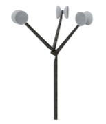
Frame / Grey anthracite 5142 Hooks / Grey 1771 C