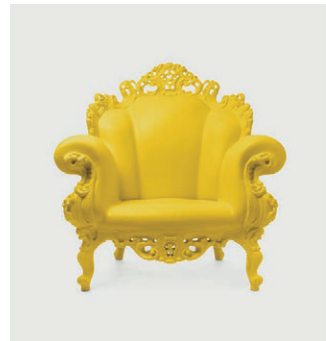
Yellow 1665 C