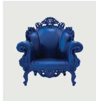
Blue 1192 C