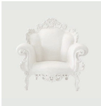
White 1735 C