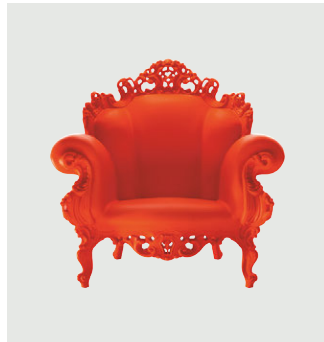
Red 1114 C