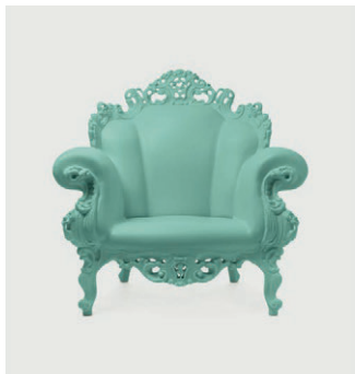
Menthol green 1831 C