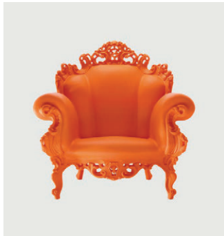
Orange 1087 C