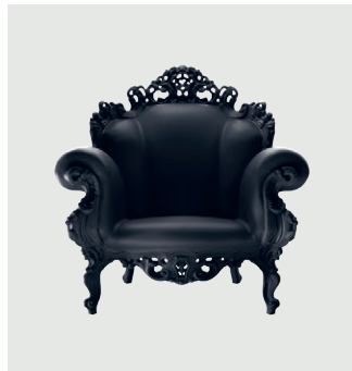
Black 1763 C