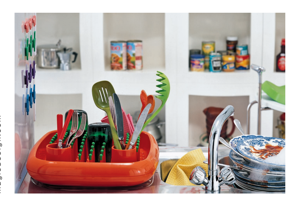
material / standard injection-moulded glossy polypropylene.

As Newson himself said: "I controlled every aspect of this design, even the packaging. We adopted fast prototyping, moving from 3D to tooling without any changes made. This dish rack is made in polypropylene like all objects of this type, yet Magis production standards are really high and the end result was fantastic!"