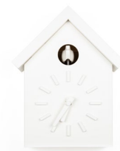
House / White 1735 C Roof / White 1735 C