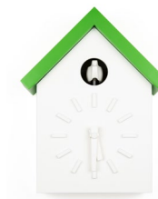
House / White 1735 C Roof / Green 1342 C