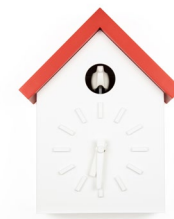
House / White 1735 C Roof / Orange 1086 C