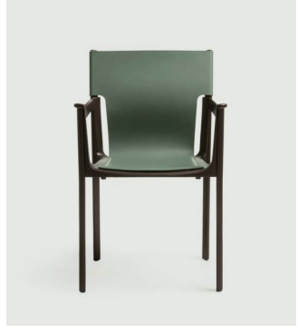
Dark bronze / Blue sage