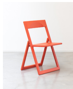
Stained coral red