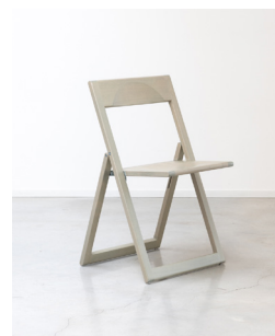
Stained light green