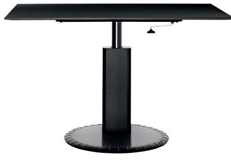
Matt colour Black 1764 C