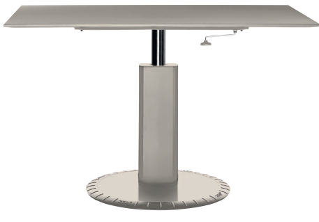
Matt colour Light Grey 1707 C