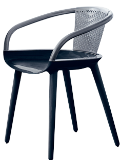
Frame: Glossy Black 1763 C Back: Dark Grey "gun metal"