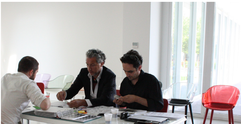
Designer in Magis

of Cyborg, a seat with a highly resistant and versatile polycarbonate shell. The seat can then be completed with backrests in a selection of different natural or synthetic materials: from polycarbonate to wicker, from solid wood to plywood, to the most recent upholstered versions with fabric or leather cover. This further evolution of the chair is in equal parts poetic and technological, cosy and surprising, in keeping with the widest range of different settings.