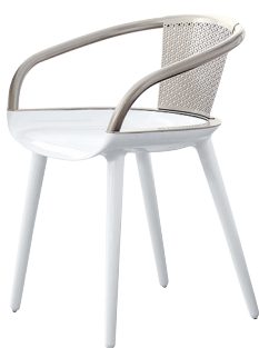
Frame: Glossy White 1736 C Back: Beige "champagne"