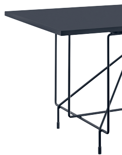
Frame: Black 5140 Top: Black 8510