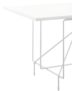
Frame: White 5108 Top: White 8500