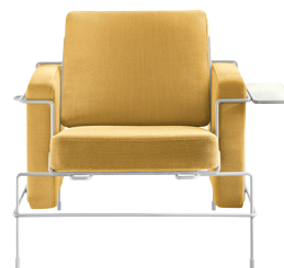
Frame: White 5011 Fabric: Yellow F-578 (453) Tablet: White