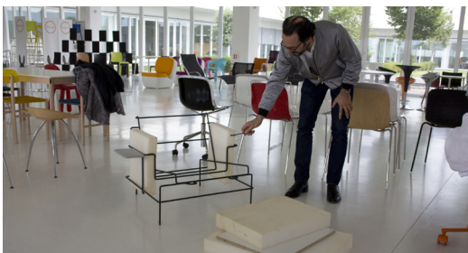
Designer in Magis

sofa, a bench in two versions, a chaise longue and an island. The collection has expanded further to include two low tables, one large, one small, and a high table, again with a metal rod frame, but with a top in artificial stone, adding another tactile sensation to the home and contract scenario.