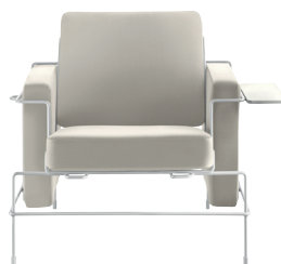
Frame: White 5011 Leather: Cream White L-0706 Tablet: White