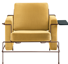
Frame: Sepia Brown 5016 Fabric: Yellow F-578 (453) Tablet: Anthracite Grey