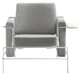
Frame: White 5011 Fabric: Light Grey F-741 (133) Tablet: White