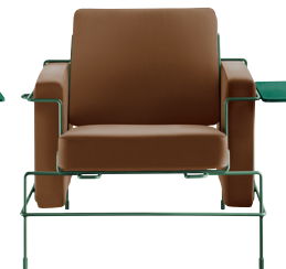
Frame: Dark Green 5021 Leather: Brown L-0111 Tablet: Dark Green