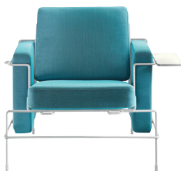
Frame: White 5011 Fabric: Light Blue F-222 (983) Tablet: White