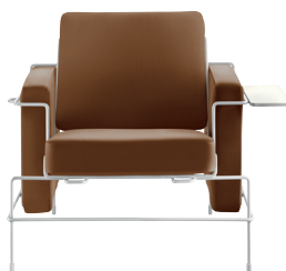
Frame: White 5011 Leather: Brown L-0111 Tablet: White