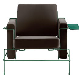
Frame: Dark Green 5021 Leather: Dark Brown L-0752 Tablet: Dark Green