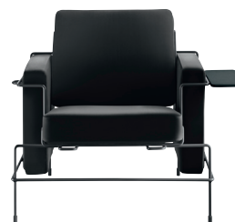
Frame: Black 5013 Leather: Anthracite Grey L-0060 Tablet: Anthracite Grey