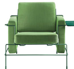
Frame: Dark Green 5021 Fabric: Green F-354 (953) Tablet: Dark Green