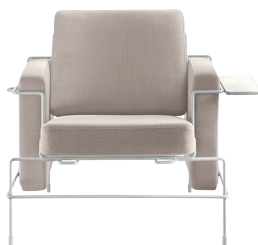
Frame: White 5011 Fabric: Beige F-266 (205) Tablet: White