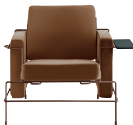
Frame: Sepia Brown 5016 Leather: Brown L-0111 Tablet: Anthracite Grey