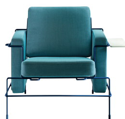
Frame: Green Blue 5017 Fabric: Light Blue F-222 (983) Tablet: White