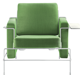
Frame: White 5011 Fabric: Green F-354 (953) Tablet: White