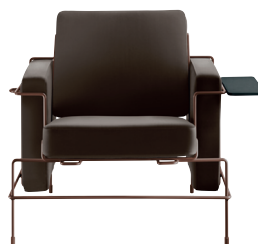
Frame: Sepia Brown 5016 Leather: Dark Brown L-0752 Tablet: Anthracite Grey