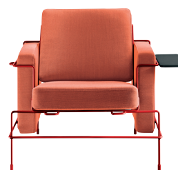
Frame: Signal Red 5019 Fabric: Orange F-088 (533) Tablet: Anthracite Grey