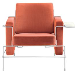
Frame: White 5011 Fabric: Orange F-088 (533) Tablet: White