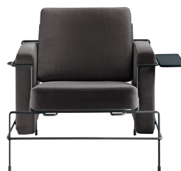
Frame: Black 5013 Fabric: Dark Brown F-521 (383) Tablet: Anthracite Grey