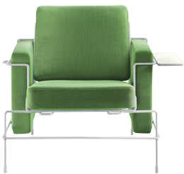
Frame: White 5011 Fabric: Green F-354 (953) Tablet: White