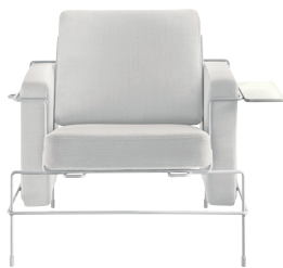
Frame: White 5011 Fabric: White F-737 Tablet: White Chaise longue and Platform not for outdoor