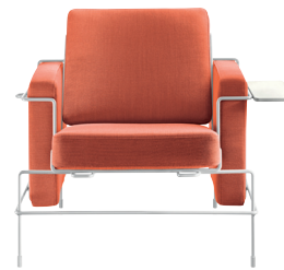
Frame: White 5011 Fabric: Orange F-088 (533) Tablet: White