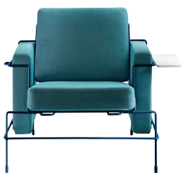
Frame: Green Blue 5017 Fabric: Light Blue F-222 (983) Tablet: White