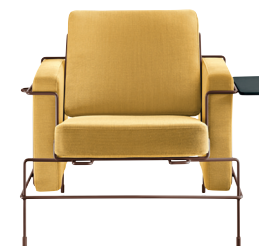
Frame: Sepia Brown 5016 Fabric: Yellow F-578 (453) Tablet: Anthracite Grey