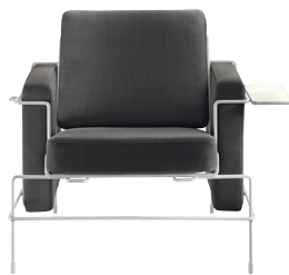
Frame: White 5011 Fabric: Black F-769 Tablet: White Chaise longue and Platform not for outdoor