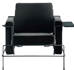
Frame: Black 5013 Leather: Anthracite Grey L-0065 Tablet: Anthracite Grey