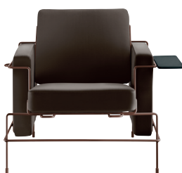
Frame: Sepia Brown 5016 Leather: Dark Brown L-0753 Tablet: Anthracite Grey