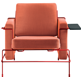
Frame: Signal Red 5019 Fabric: Orange F-088 (533) Tablet: Anthracite Grey

The Kvadrat colour numbers are indicated in brackets next to the Magis inner colour number. The information included in this product sheet are based on the last data in our current pricelist. Magis reserves the right to modify the products without notice.