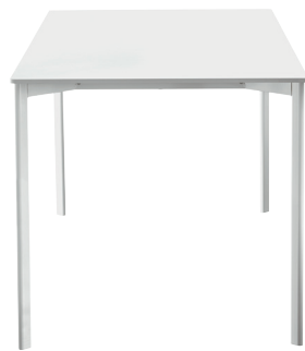
Frame: White 5108 Top: White 8500