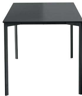
Frame: Black 5130 Top: Black 8510