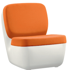
Shell: White 1736 C Cushions: Orange F-083 (542)