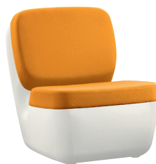
Shell: White 1736 C Cushions: Yellow F-576 (426)