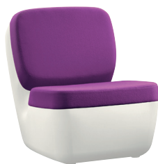
Shell: White 1736 C Cushions: Purple F-488 (666)