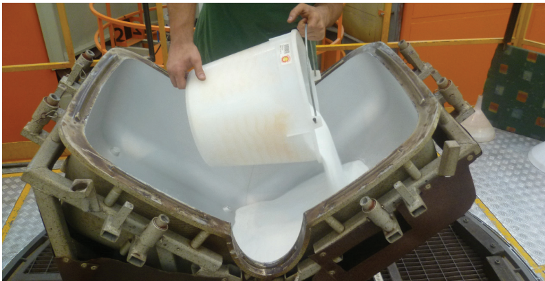
Production process and designer in Magis

The development of Nimrod low chair was the fruit of many years of research that eventually led to the definitive product, which has been on the market since 2009. Magis' initial objective was to produce this piece using blow-moulding technology, but after countless attempts to achieve the level of technical quality the company has always demanded, this quest was abandoned in favour of rotational moulding, which provided a better aesthetic definition of the chair.