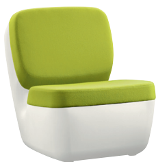
Shell: White 1736 C Cushions: Green F-346 (936)