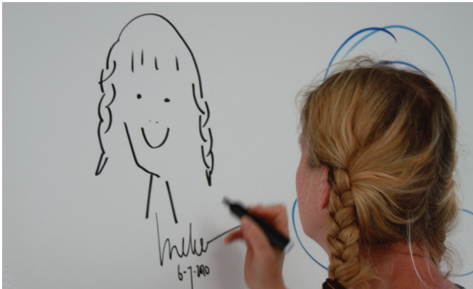
Designer in Magis

be combined to suit individual tastes and needs, offering scope for practically infinite possibilities, like a construction toy.