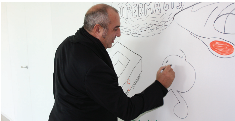
Designer in Magis

A broom with a proud handle, pleasant to grasp, conceived with the idea of offering a homogeneity of shape and material. Air-moulded in polypropylene with glass fibre added, Magò is also the first broom to stand up on its own.