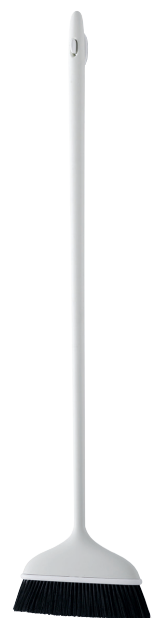
Matt colour White 1700 C