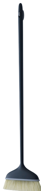
Matt colour Grey Anthracite 1430 C