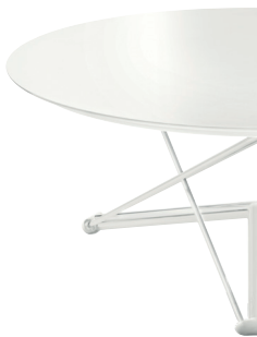
Frame: White 5108 Top: White 8500