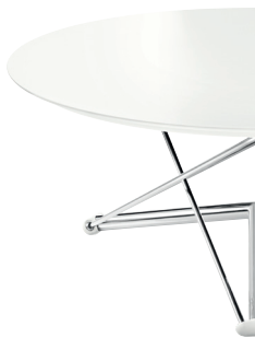
Frame: Chromed Top: White 8500