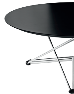
Frame: Chromed Top: Black 8510