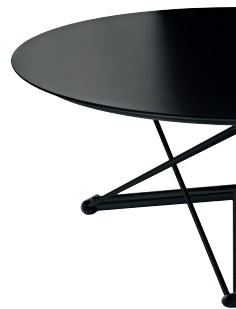
Frame: Black 5140 Top: Black 8510