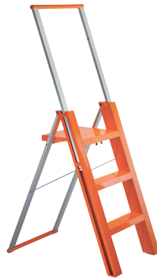
Glossy colour Orange 1660 C