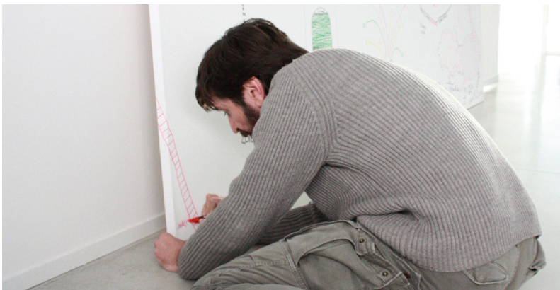
Designer in Magis

Flò is a light, practical and extremely sturdy folding stepladder, with an aluminium frame and ABS steps. It is opened and closed by simply raising or lowering the cross-bar on the safety rail, which disappears entirely when the ladder is closed, making it neat,