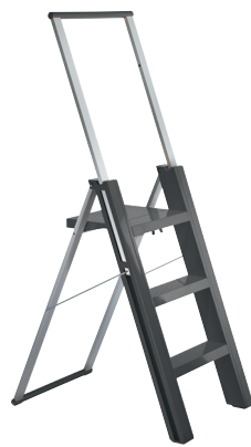
Glossy colour Grey Anthracite 1420 C