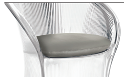
Cushion (fabric) Beige F-455