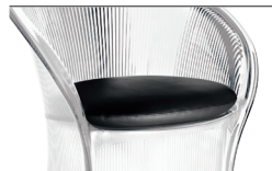
Cushion (leather) Black L-0795

Arm sideways static load test EN 15373:2007, L3 - severe Seat and back static load test EN 15373:2007, L3 - severe Leg forward static load test EN 15373:2007, L3 - severe Leg sideways static load test EN 15373:2007, L3 - severe Arm downwards static load test EN 15373:2007, L3 - severe Seat front edge fatigue test EN 15373:2007, L3 - severe Arm fatigue test EN 15373:2007, L3 - severe Seat and back fatigue test EN 15373:2007, L3 - severe Non-domestic seating. Vertical load on back rest EN 15373:2007, L3 - severe Stability EN 1022:2005 Arm impact test EN 15373:2007, L3 - severe Seat impact test EN 15373:2007, L3 - severe Back impact test EN 15373:2007, L3 - severe