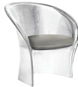
Transparent colour Clear 2540 TR