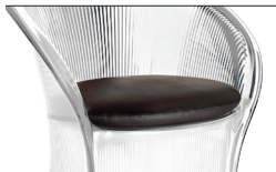
Cushion (fabric) Brown F-071