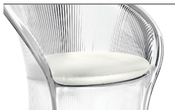
Cushion (leather) White L-0700