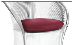
Cushion (fabric) Dark Red F-129