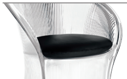
Cushion (fabric) Black F-766