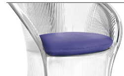
Cushion (fabric) Purple F-486