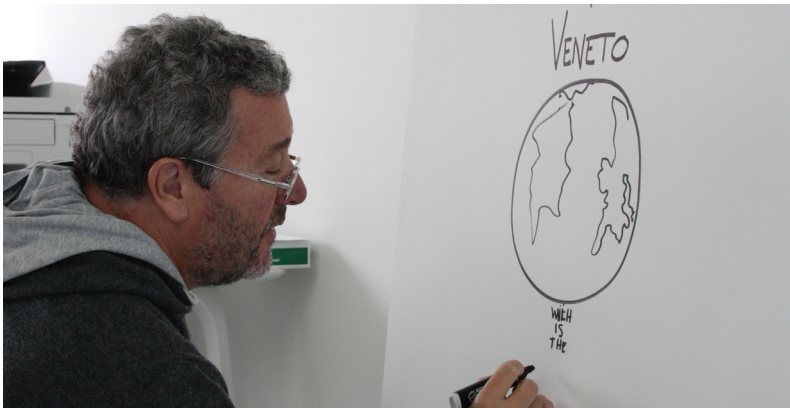
Designer in Magis

Available in three sizes, suitable for any space and purpose: 200 x 90 cm, 160 x 90 cm and an extending version, measuring 160/220 x 90 cm.