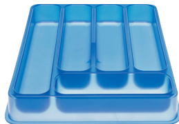
Translucent colour Blue 2040 TL