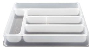
Translucent colour Clear 2080 TL