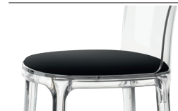
Cushion (leather) Black L-0795 For all finishes