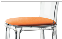
Cushion (fabric) Orange F-080 (542) For all finishes