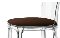
Cushion (leather) Brown L-0751 Only for transparent and white glossy colour