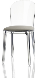
Transparent colour Clear 2540 TR