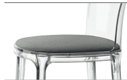
Cushion (fabric) White-Black mélange F-505 (142) For all finishes