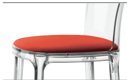
Cushion (fabric) Red F-120 (662) For all finishes