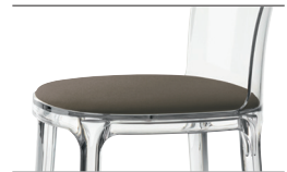
Cushion (fabric) Grey-Brown mélange F-520 (252) Only for transparent and white glossy colour