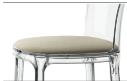
Cushion (fabric) Beige F-265 (232) Only for transparent and white glossy colour