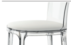
Cushion (leather) White L-0700 For all finishes