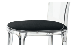
Cushion (fabric) Black F-768 (192) For all finishes