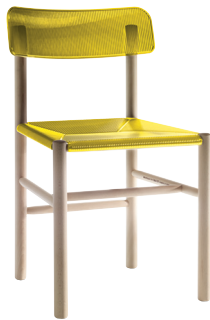
Transparent colour Yellow 2495 TR