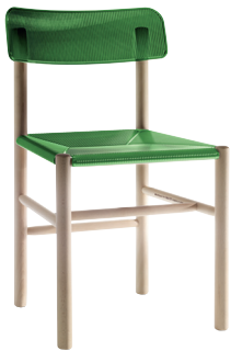
Transparent colour Green 2480 TR