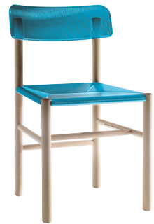
Transparent colour Sky Blue 2531 TR

Seat and back static load test EN 15373:2007, L3 - severe Leg forward static load test EN 15373:2007, L3 - severe Leg sideways static load test EN 15373:2007, L3 - severe Seat front edge fatigue test EN 15373:2007, L3 - severe Seat and back fatigue test EN 15373:2007, L3 - severe Back impact test EN 15373:2007, L3 - severe