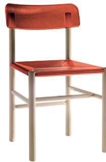
Transparent colour Red 2513 TR