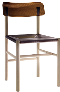
Transparent colour Brown 2503 TR