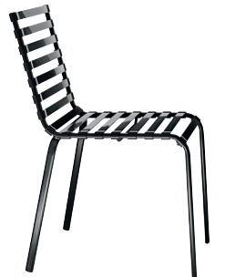
Frame: Black 5130 Slats: Smoke Grey 2017