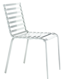
Frame: White 5108 Slats: White 2068