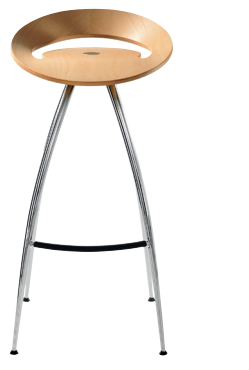
Frame: Chromed Seat: Natural Beech