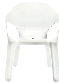
Matt colour White 1734 C