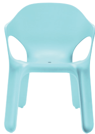
Matt colour Light Blue 1260 C