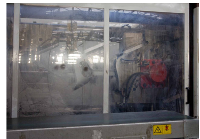
Production Process and designer in Magis