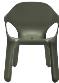
Matt colour Olive Green 1664 C