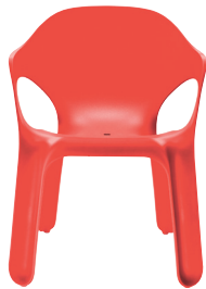
Matt colour Red 1483 C