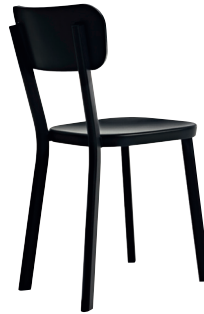
Outdoor use Black 5130