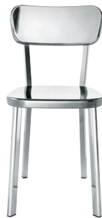
Indoor use Polished Aluminium