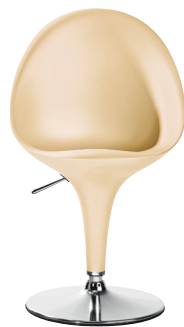
Matt colour Ivory 1020 C