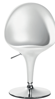
Matt colour White 1690 C