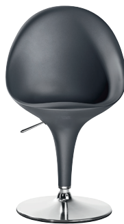
Matt colour Grey Anthracite 1420 C