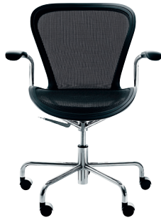
Frame: Chromed Surround: Black 1763 C Seat fabric: F-763