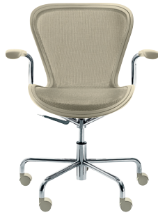
Frame: Chromed Surround: Beige 1713 C Seat fabric: F-713