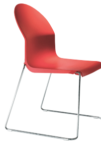
Matt colour Red 1100 C