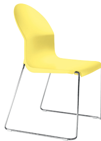
Matt colour Yellow 1030 C